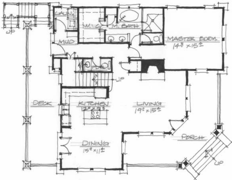
First Floor Plan 1340 Square Feet